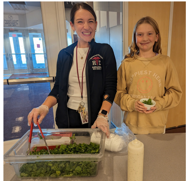
Flex Farm Reps give sixth graders a presentation