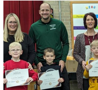
Kindergarten & 1st