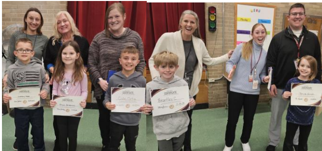
2nd & 3rd Grade Winners